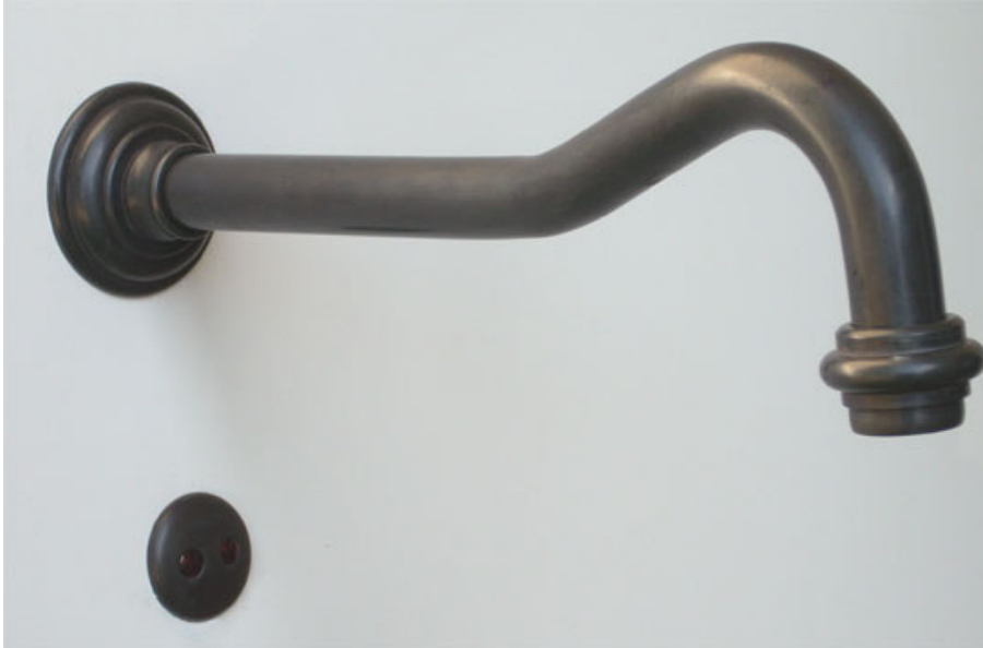
Autoluxe Faucets Are Available In Twenty Finishes